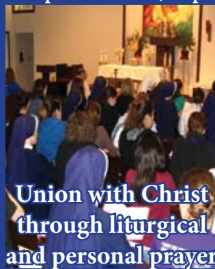
Union with Christ through liturgical and personal prayer