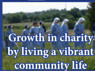
Growth in charity by living a vibrant community life